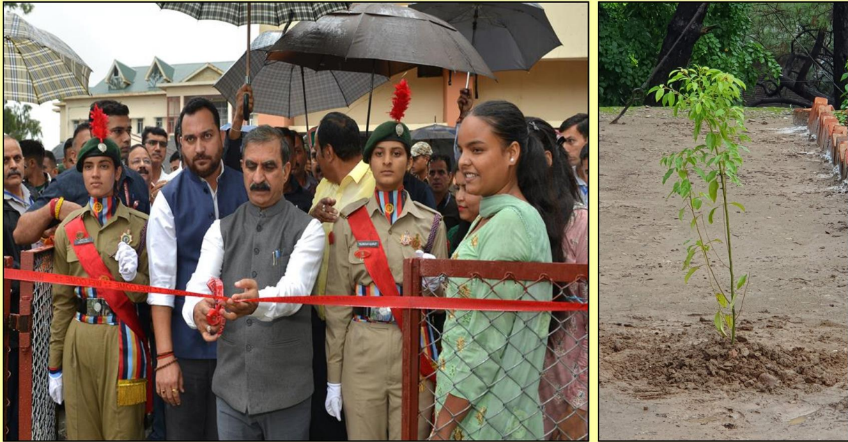
ON JULY 9, 2023 THE HON'BLE CHIEF MINISTER INAUGURATED AYUSH GARDEN AND MARKED THE OCCASION BY PLANTING A CAMPHOR TREE.