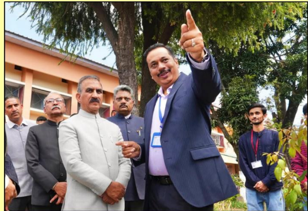
BRIEFING THE HON'BLE CHIEF MINISTER ON THE AYUSH GARDEN; MARCH 12, 2025