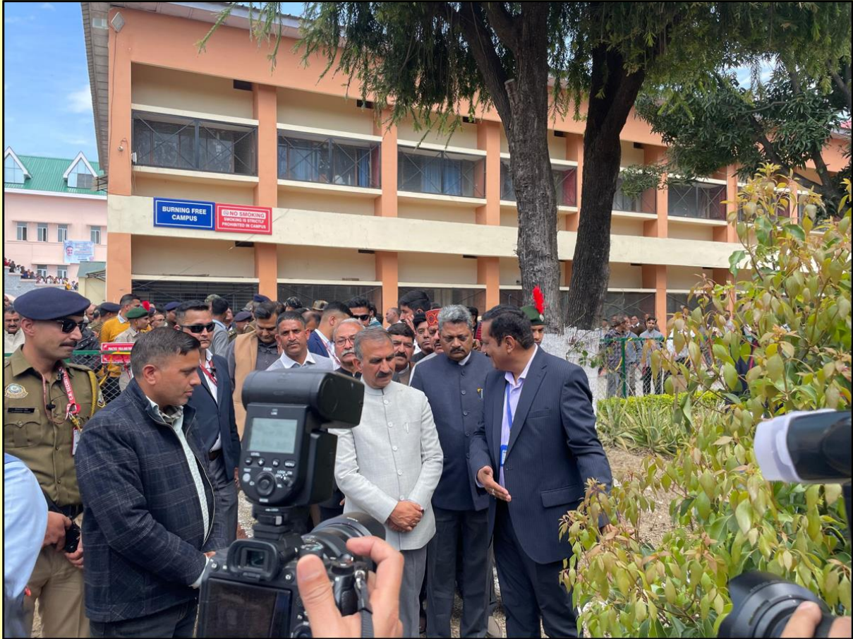
ON MARCH 12, 2025, IN THE AYUSH GARDEN , COMMITTEE MEMBERS WELCOMED THE HON'BLE CHIEF MINISTER AND SHOWCASED THE CAMPHOR TREE HE HAD PLANTED TWO YEARS EARLIER.